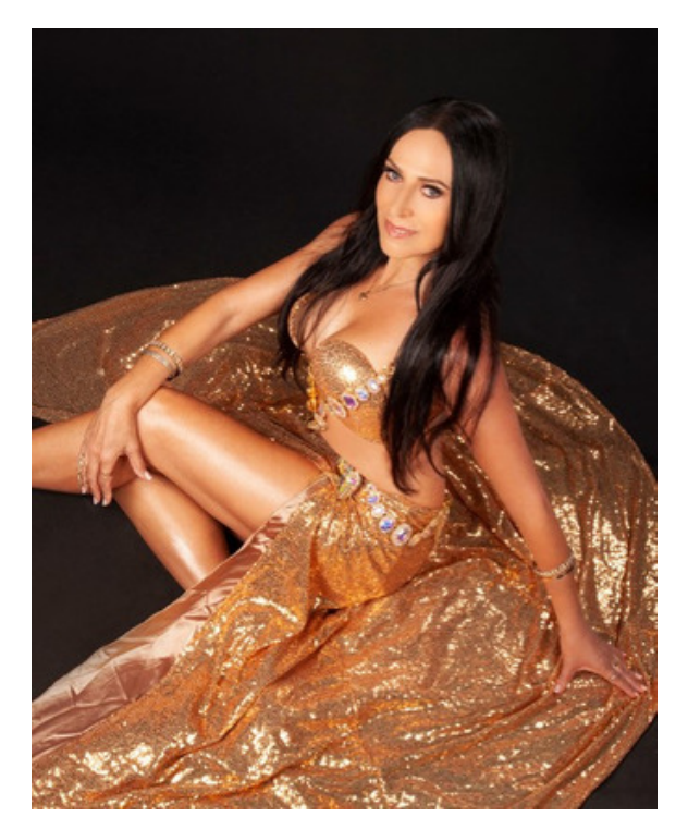
Top: Diamonds of the Desert

Contact: Phone: 0400 881 815 Email: info@bellydancegoldcoast.com.au Web: www.bellydancegoldcoast.com.au