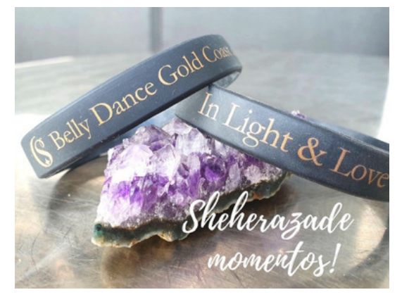
New wrist bands as a momento for every student & client.

We absolutely love the feedback that we have been receiving over this past term. We would love it if you could take two minutes out of your day to leave us a review on Facebook or Google (or both if you really love us!). Simply click on the links below to be taken directly to our review pages. Thank you for your continued support! Facebook Google