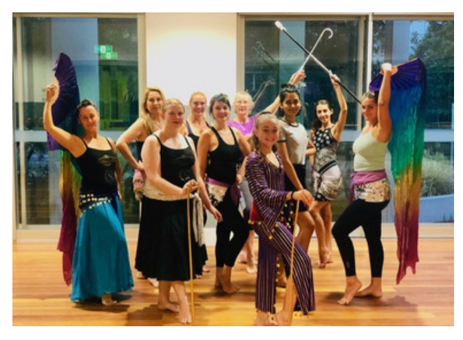
The Robina Dreams of the Desert learning how to dance with the stick (Assaya) and fan veils.