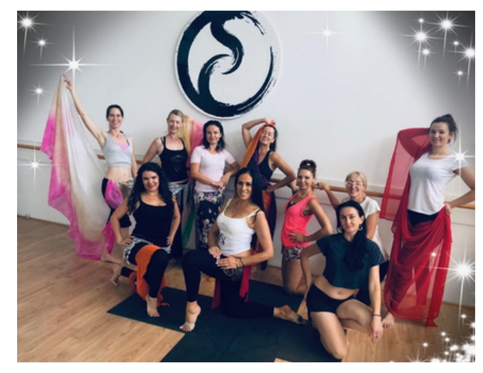
At the Belly Dance Summer Workout Workshop